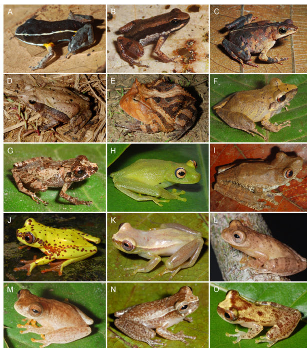
Figure 2. Photos of some of the species found in the Floresta Nacional de Pau-Rosa, municipality of Maués, state of Amazonas, Brazil. (A) Allobates femoralis , (B) Allobates masniger , (C) Amazophrynella bokermanni , (D) Rhinella gr. margaritifera , (E) Ceratophrys cornuta , (F) Pristimantis fenestratus , (G) Pristimantis sp. 1, (H), Boana cinerascens , (I), Boana wavrini , (J) Dendropsophus mapinguari , (K) Dendropsophus minusculus , (L) Dendropsophus minutus , (M) Dendropsophus ozzyi , (N) Dendropsophus schubarti , (O) Dendropsophus sp. 1. This figure is in color in the electronic version.