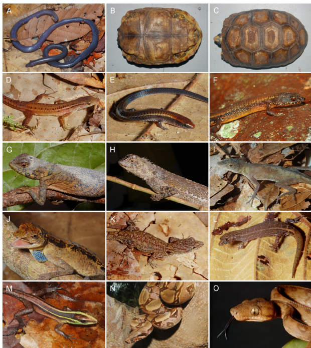
Figure 4. Photos of some of the species found in the Floresta Nacional de Pau-Rosa, municipality of Maués, state of Amazonas, Brazil. (A) Caecilia gracilis , (B) Chelonoidis denticulata in ventral view, (C) Chelonoidis denticulata in dorsal view, (D) Cercosaura sp. (E) Iphisa elegans , (F) Loxopholis osvaldoii , (G) Plica umbra , (H) Uranoscodon superciliosus , (I) Norops fuscoauratus , (J) Norops tandai , (K) Gonatodes humeralis , (L) Lepidoblepharis heyerorum , (M) Kentropyx calcarata , (N) Boa constrictor , (O) Corallus hortulanus . This figure is in color in the electronic version.