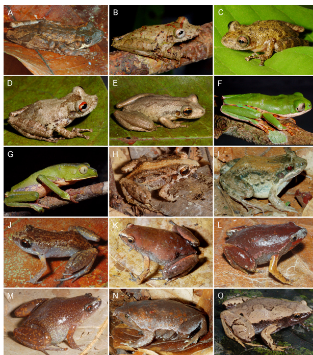
Figure 3. Photos of some of the species found in the Floresta Nacional de Pau-Rosa, municipality of Maués, state of Amazonas, Brazil. (A) Osteocephalus taurinus , (B) Scinax garbei , (C) Scinax sateremawe , (D) Scinax sp. 1, (E), Scinax sp. 2, (F) Phyllomedusa vaillanti , (G) Pithecopus hypochondrialis , (H) Adenomera sp. 1, (I) Leptodactylus petersii , (J) Phyzelaphryne miriamae , (K) Chiasmocleis avilapiresae , (L) Chiasmocleis bassleri , (M) Chiasmocleis hudsoni , (N) Ctenophryne geayi , (O) Hamptophryne boliviana . This figure is in color in the electronic version.