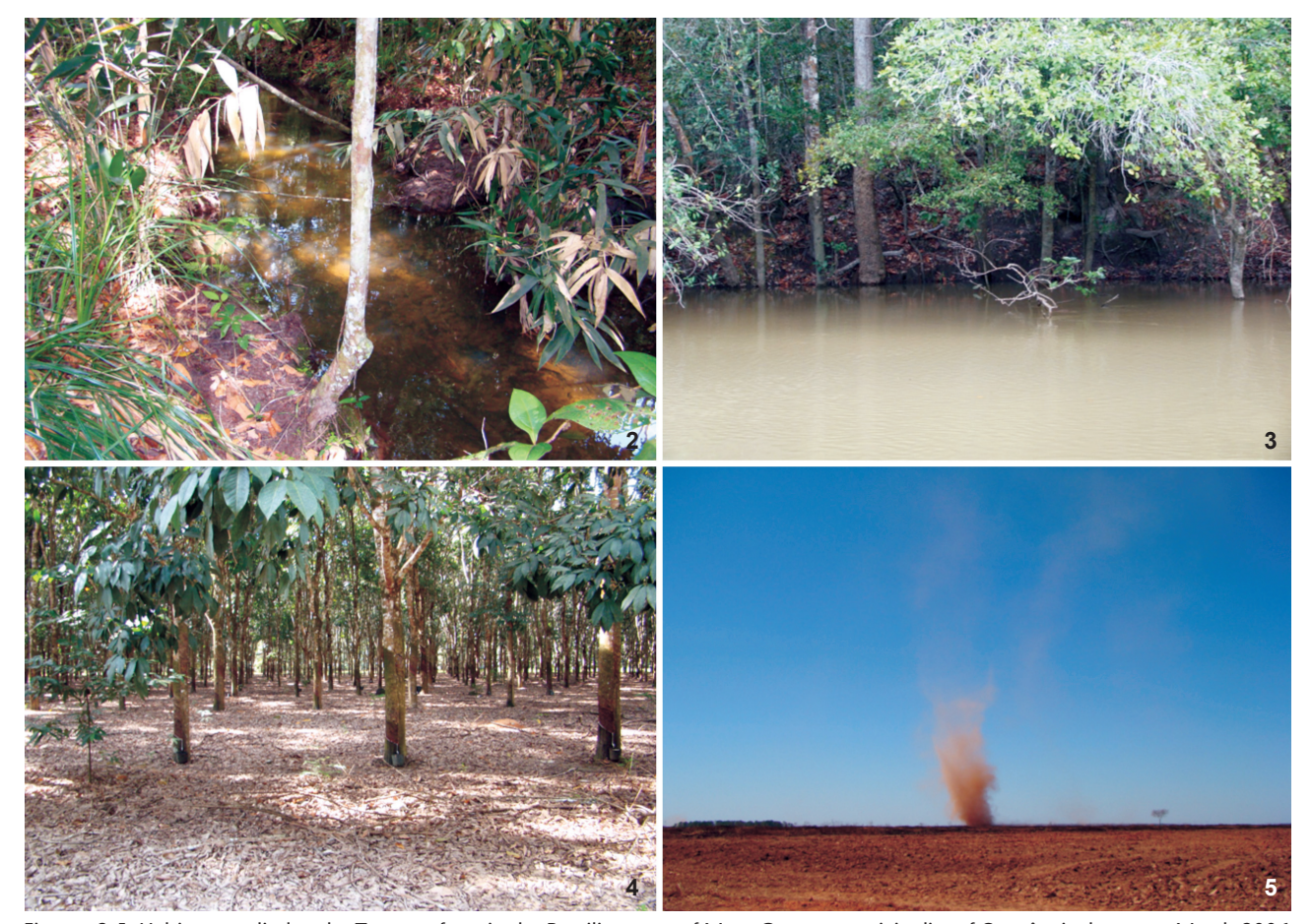
Figures 2-5. Habitats studied at the Tanguro farm in the Brazilian state of Mato Grosso, municipality of Querência, between March 2006 and February 2009: (2) Stream; (3) Tanguro river margins; (4) plantations of rubber trees; (5) soybean plantations.

The first five excursions lasted on 30 days each, on average, and were conducted between March 2006, and July 2008. They took place in four preserved areas, which consisted of permanent forest reserves centered on perennial watercourses. Specimens were captured by active searchand pitfall traps. The latter consisted of five 60-liter buckets set in lines of 40 m. Three traps were set in each forest reserve. During the two final excursions (between December 2008, and February 2009), which lasted about 45 days each, active searches were based on both visual and auditory cues (during nocturnal sampling), and were conducted in 54 half-hectare plots distributed among the four principal environments identified within the study area