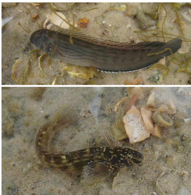
Fig. 1. Omobranchus punctatus in natural habitat (tide pools) in Brazil.

from the Caribbean entrance of the Panama Channel. Fish collections made between 1935 and 1937 at the Pacific side of the Channel (Miraflores locks) by Hildebrand (1939) yielded no specimens of O. punctatus . Also, the species was not recorded in these areas by McCosker & Dawson (1975). To date, there is no evidence of its occurrence on the Pacific coast of Panama. The Channel first began operation in 1914. The first record of O. punctatus in Trinidad dates from the 1930s. The first records of O. punctatus in Panama, at the Caribbean entrance to the canal, are from 1967, much later than the first record from Trinidad (1930) (Table 1). Springer & Gomon (1975) and Carlton (1985) suggested that it is likely that specimens of muzzled blenny from Panama originate via shipping movements from the population at Trinidad. This hypothesis was supported by strong similarities in the morphology of specimens collected from those two countries.