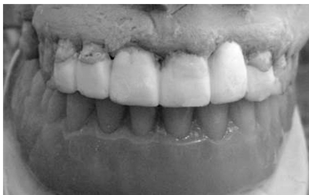
Figure 2. Full-mouth diagnostic wax-up performed in stone casts mounted in a semi-adjustable articulator and used as a guide to determine the proper teeth reconstruction.

The new anatomy of the maxillary teeth was replicated from the wax-up using a silicone impression material (Optosil; Heraeus Kulzer, Hanau, Hesse, Germany). These silicone stops were built on the palatal and occlusal surfaces to guide the proper reconstruction of the teeth by resin restorations. The maxillary anterior teeth were cleaned with prophylactic paste and the operating field