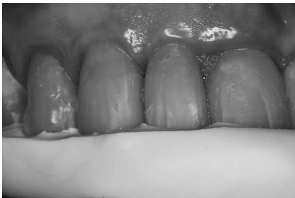
Figure 4. Silicone stop reference used to guide the restoration of each tooth by individual resin layers.