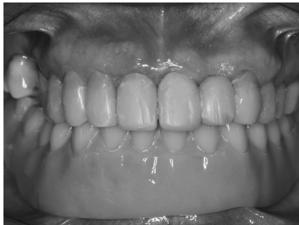
Figure 5. Front view of the full-mouth rehabilitation with direct resin restorations in the maxillary anterior teeth and the mandibular overdenture in position.