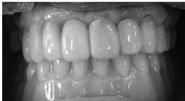
Figure 7. Full-mouth view during the follow-up appointment. No restoration had failed and the mandibular overdenture was stable.