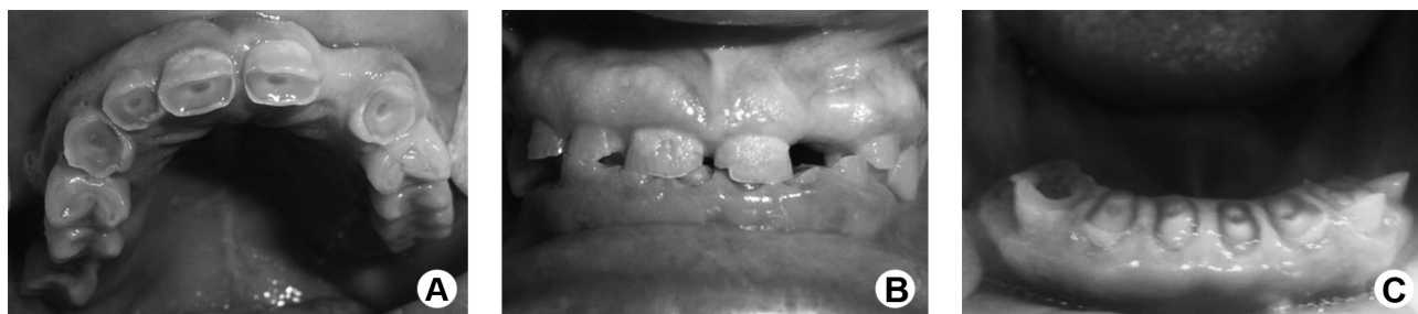
Figure 1. Initial condition showing a marked reduction of tooth length and consequent occlusal collapse with pronounced loss of occlusal vertical dimension and irregular occlusal plane. A: Occlusal view of the maxillary arch. B: Anterior view of the maximum intercuspation position. C: Occlusal view of the mandibular arch.

Study cast models were obtained from primary impressions (Alginate Hydrogum; Zhermack, Rovigo, Veneto, Italy) and photographs were used to document the patient's current condition. The casts were mounted in a semi-adjustable articulator (BioArt, Equipamentos Odontologicos Ltda., São Carlos, SP, Brazil) using an arbitrary facebow (BioArt). These stone casts were also used for a full-mouth diagnostic wax-up (Fig. 2). During this procedure, a 6 mm increment of the current OVD was planned. This new OVD was carefully determined by esthetic, phonetic and facial proportion methods (2). This procedure aimed to restore the functional harmony of masticatory muscles and the most suitable position of the condyles in the mandibular