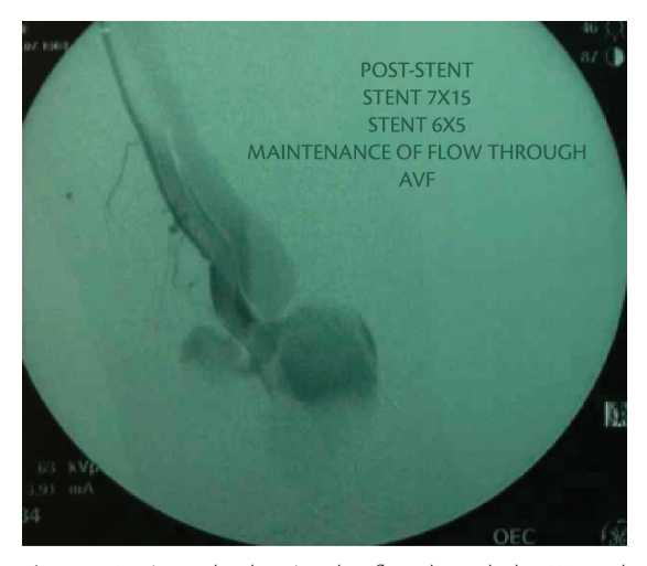
Figure 3. Angiography showing that flow through the AVF and into the pseudoaneurysm continued even after placement of the stents.

The unsatisfactory technical result of covered stent placement in the case described here was because of the fact that its diameter was too small for the caliber of the popliteal artery proximal of the AVF.