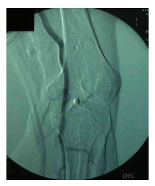
Figure 6. Intraoperative angiography after completion of banding, showing no opacification of the pseudoaneurysm or of the AVF.

Arterial dilation proximal to AVFs was described by Hunter as early as 17539 and is well-documented in the literature.<sup>3,10</sup> This dilation can lead to formation of true aneurysms. Although less common, arteriomegaly can continue to develop even after occlusion of the AVF.3,10 There is more than one theory attempting to explain arterial dilation proximal of the AVF, one of which is based on intensification of shear forces on the endothelium, secondary to localized increase in vascular flow.<sup>3,10</sup> According to this theory, there is an increase in production of endothelium-derived relaxing factor, which causes vasodilation by acting on the smooth musculature of the artery.<sup>10</sup> This theory explains why the arterial branches and the artery distal of the AVF are unaffected by arteriomegaly,10 but it cannot explain why the dilation should continue to develop after occlusion of the AVF.3,10