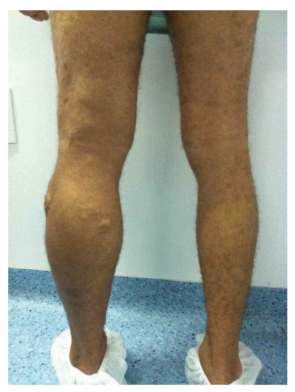
Figure 1. Edema and large caliber varicose veins in the left lower limb.

Endovascular treatment was prescribed. Two Viabahn (Gore<sup>®</sup>) stent grafts were available with the following dimensions: 6 mm \times 5 cm and 7 mm \times 15 cm. The procedure was conducted under local anesthesia. There was a large difference between the diameter of the popliteal artery proximal to the AVF and its diameter immediately distal from the AVF and so the decision was taken to employ the 6 mm \times 5 cm