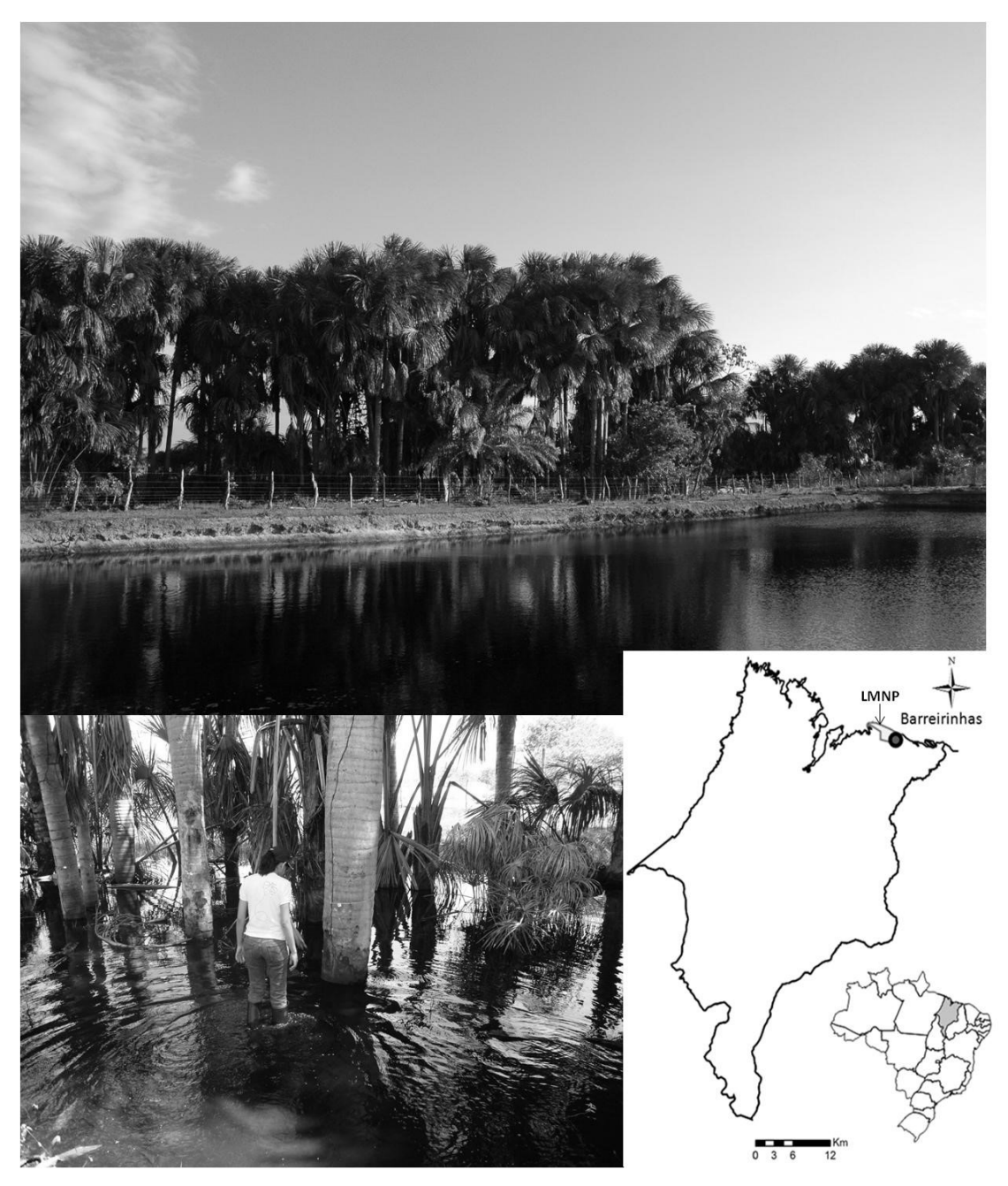
Figure 1. Location of the study area in the municipality of Barreirinhas, Maranhão (Brazil), showing the Lençóis Maranhenses National Park (LMNP).

of individuals presenting the same phenophase during a given period (Bencke and Morellato, 2002). Based on this, the phenological event was classified as non-synchronic or asynchronic when no more than 20% of the individuals presented the same phenophase, low synchrony when 21-60% of the individuals presented the same phenophase, and high synchrony when more than 60% of the individuals were in the same phase (Bencke and Morellato, 2002). Comparisons among years were based on the production of