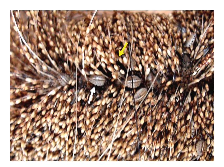
Figure 2. Haematopinus quadripertusus : Nits (yellow arrow) and adults (white arrow) on the tail of a cow with intense infestation.

exhibited a sternal plate with long sharp anteromedian projections in both the male and female specimens, and the males exhibited a genital plate. The female specimens (n = 116) measured on average 4.14 \pm 0.48 mm in length, while the males (n = 17) and nymphs (n = 92) measured on average 3.44 \pm 0.39 mm and 2.45 \pm 0.65 mm, respectively.